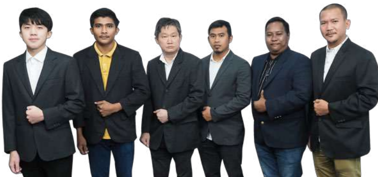
Local Recruitment Cum Hostel Management