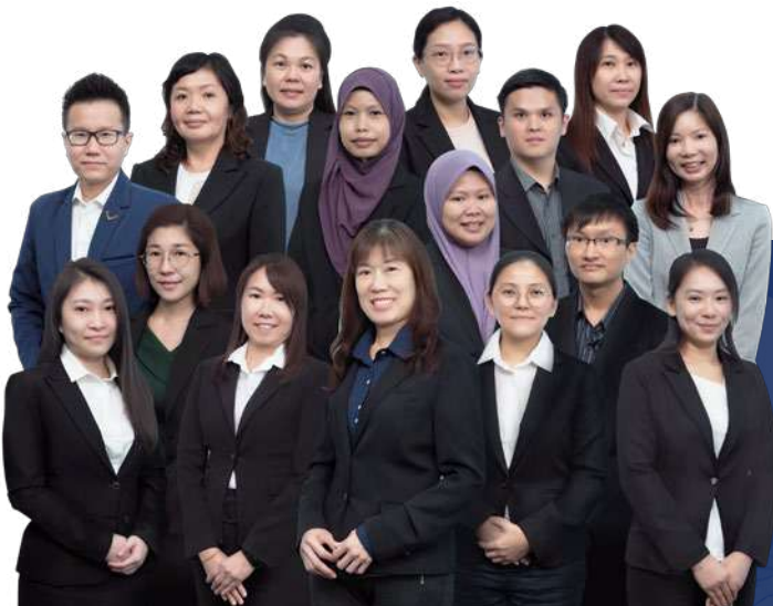
Finance & Account