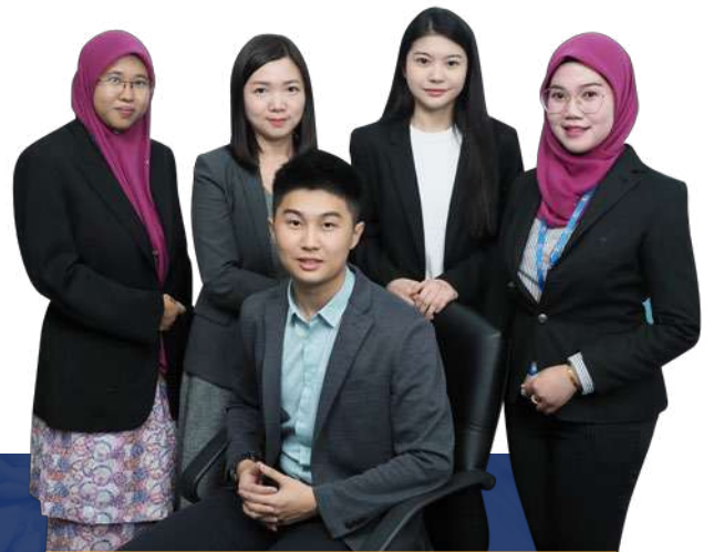
Customer Relationship Management